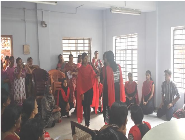
IMA TELlicherry NEWS LETTER FEBRUARY 2015